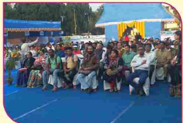
Environment Fair - 2019