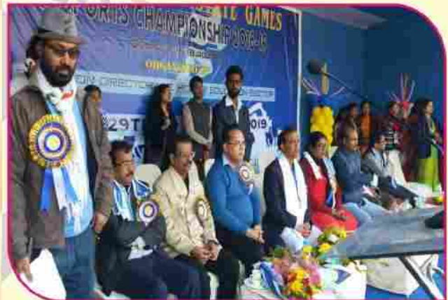
Inter-College State Games & Games Championship 2018-19