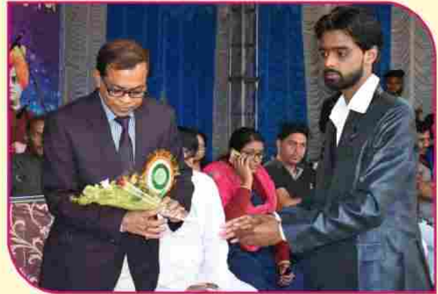
Felicitating the Principal