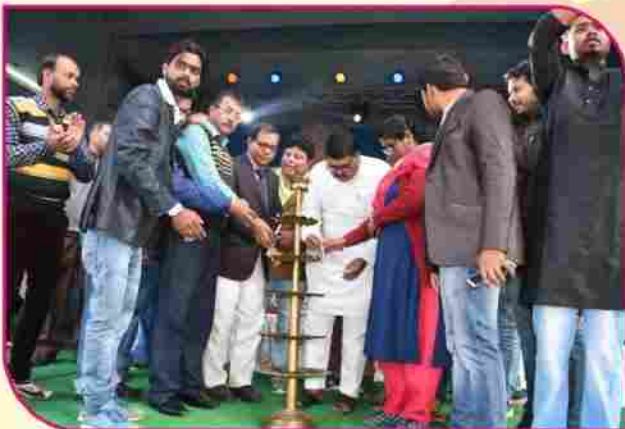
Inauguration of Mrittika