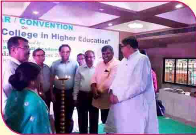
VC, KNU & Hon'ble Mayor Inaugurating the Seminar